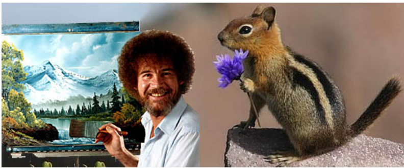
Bob Ross rescued and cared for so many squirrels that all rodents now love him. When his squirrel population grew too large, rumor has it he released some into the UP - including the fabled albino squirrel.